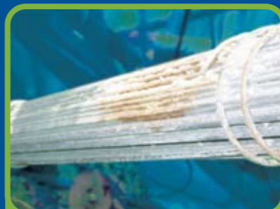
Environment Change Technologies