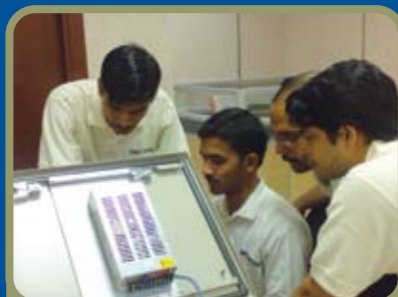
Environment Systems Integration